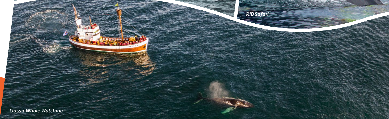
Classic Whale Watching