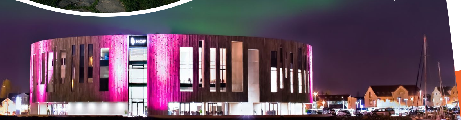
Hof Cultural Center