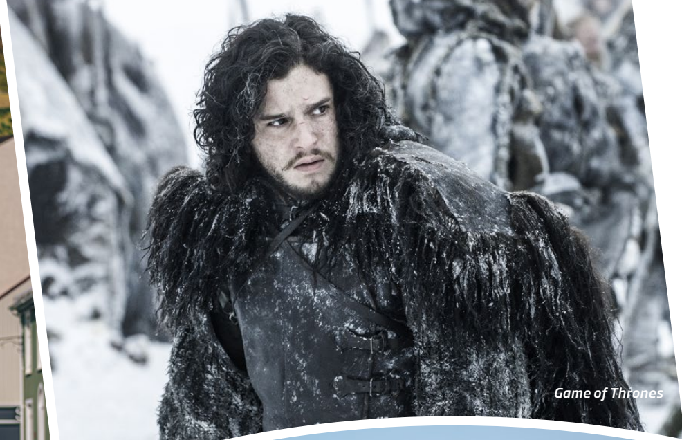
Game of Thrones