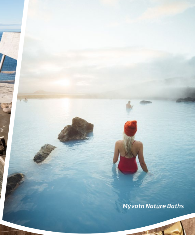
Mývatn Nature Baths