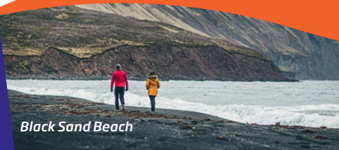
Black Sand Beach

Mannamót Natural Iceland Travel Trade Show is an annual event where you can meet representatives from up to 250 tourism companies from all over Iceland.