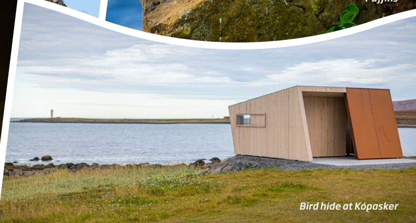
Bird hide at Kópasker