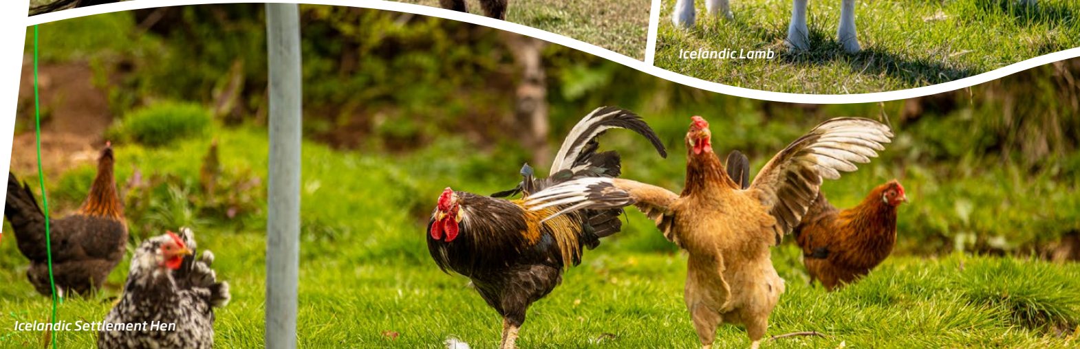
Icelandic Settlement Hen