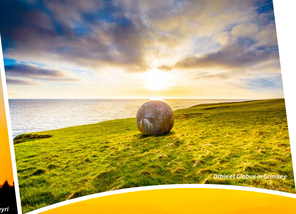
Orbis et Globus in Grímsey