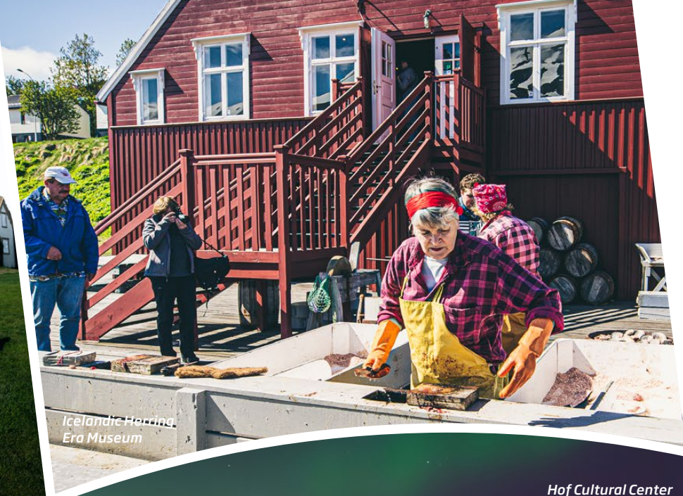
Icelandic Herring Era Museum