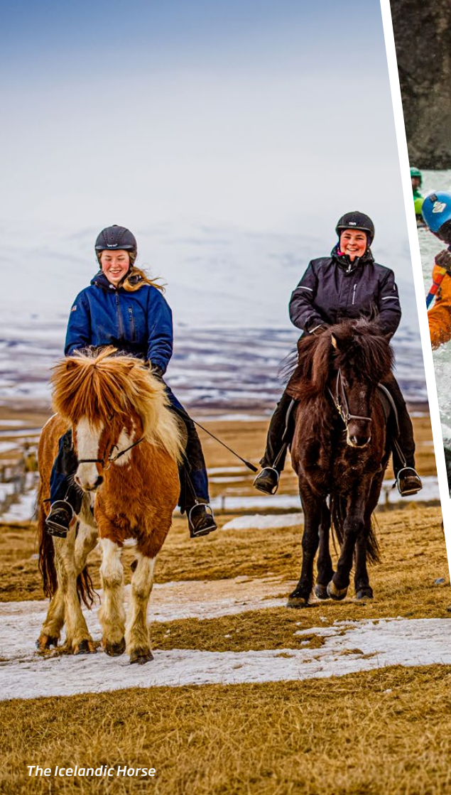
The Icelandic Horse