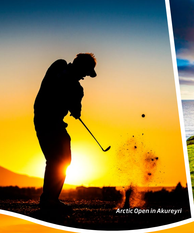
Arctic Open in Akureyri